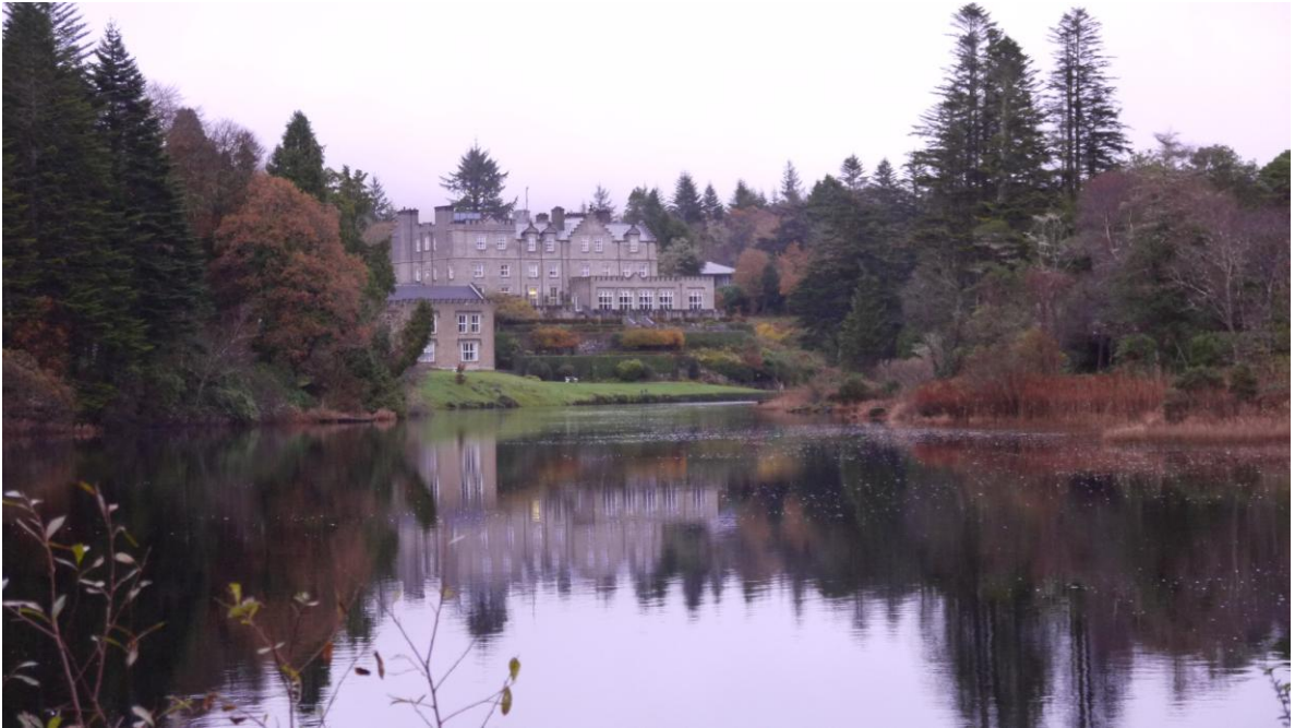
Ballynahinch Castle Hotel: Connemara, Co. Galway.